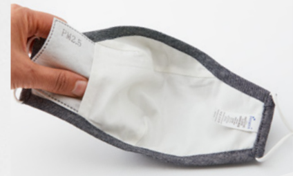
Pocket for optional Premier PR797 PM2.5 filter