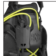
HAIX® RAPIDFIT System