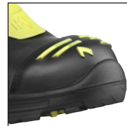
HAIX® High Durability Cap System