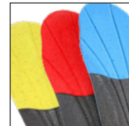
HAIX® Vario Wide Fit System